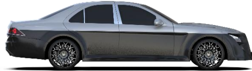
BLACK & SILVER METALLIC