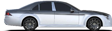
BLACK & WHITE METALLIC