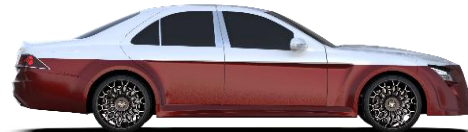
WHITE & DARK RED METALLIC