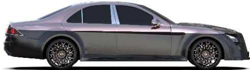
BLACK & COPPER