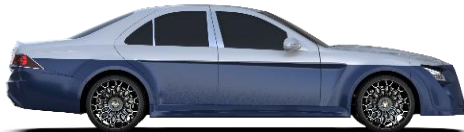
DARK COBALT BLUE & WHITE